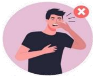
do not sneeze in the palm of your hand