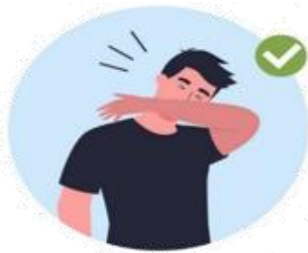
sneeze on your elbow or scarf