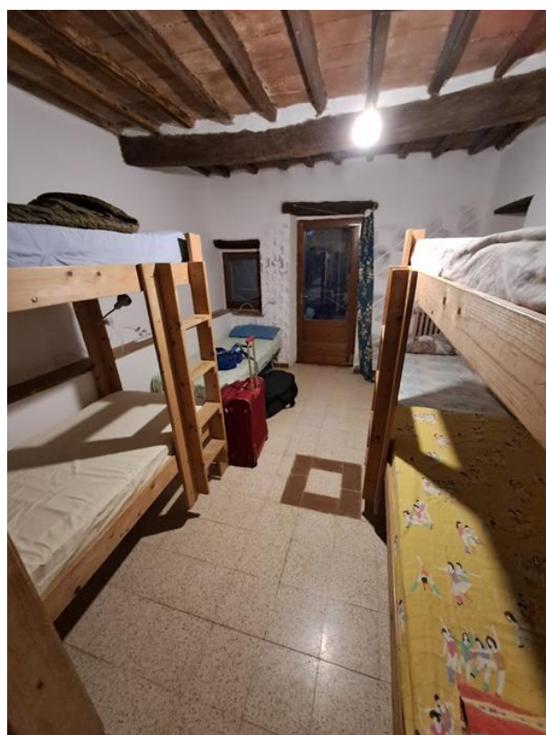
One of the bedroom