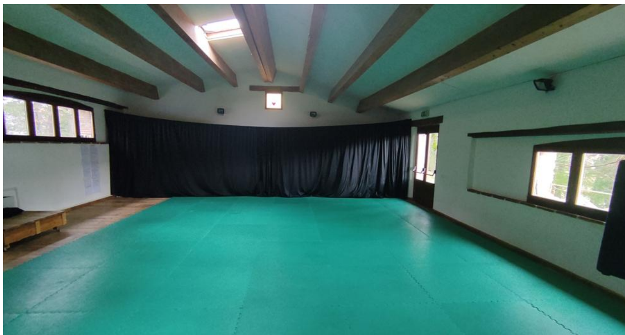
The activity room